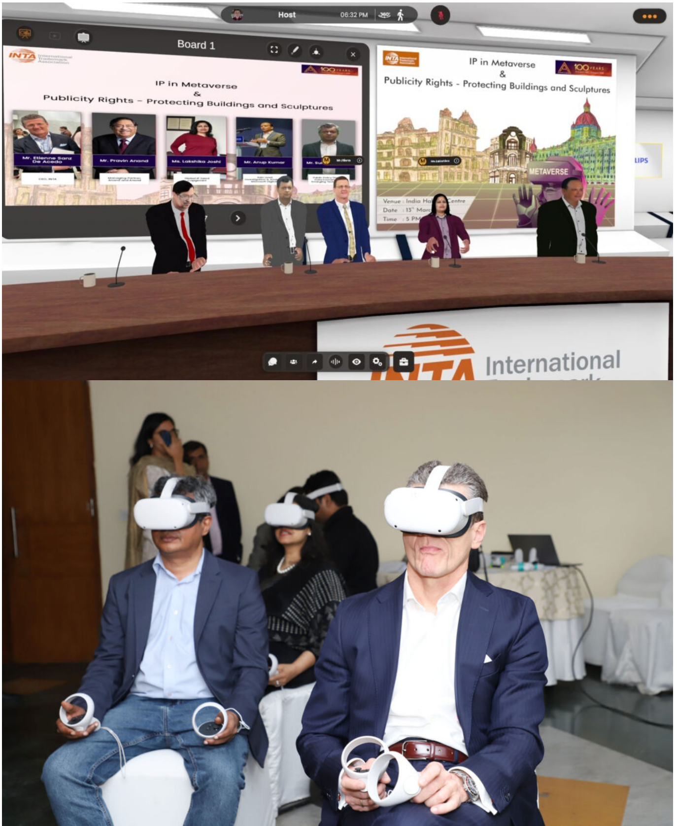
Anand and Anand in Metaverse to Discuss 'IP in Metaverse'