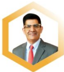
Safir Anand Trade Mark Star 2024